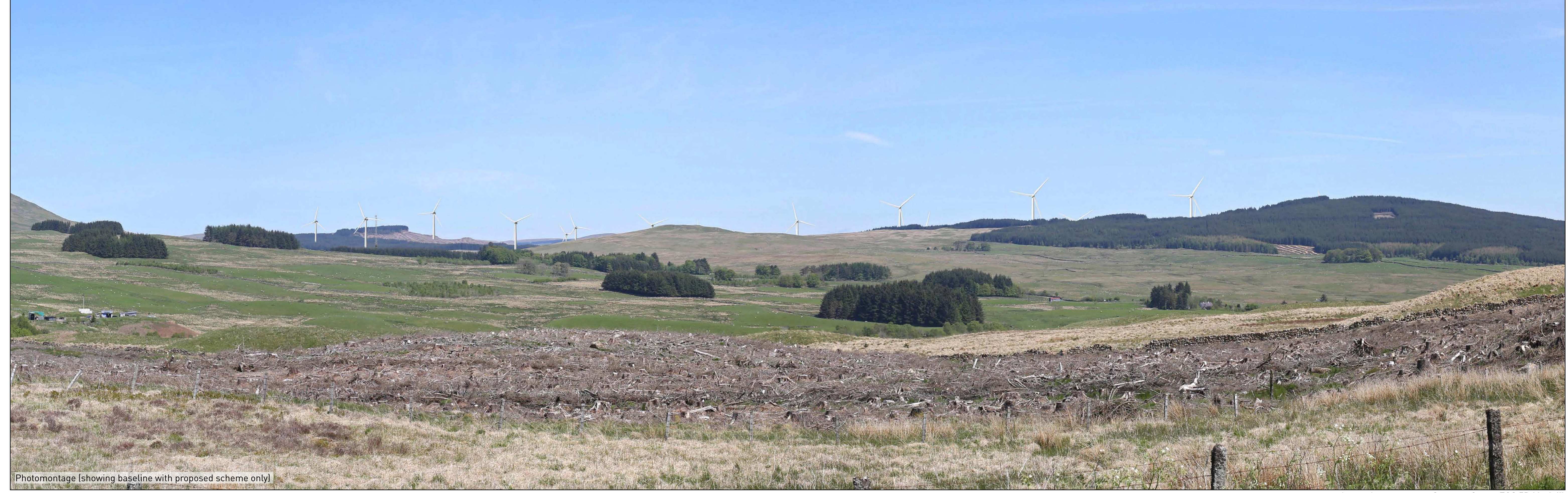
Figure 8.55 (sheet C) Viewpoint 19: A713 south of Carsphairn SHEPHERDS' RIG WIND FARM